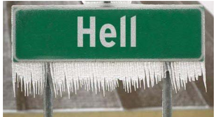
Yep, it froze over!