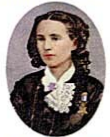
Medal of Honor USA 20c

revised the Medal of Honor standards to include only "actual combat with an enemy" She refused to give back her Medal of Honor, wearing it every day until her death in 1919. A relative told the New York Times: "Dr. Mary lost the medal simply because she was a hundred years ahead of her time and no one could stomach it." An Army board reinstated Walker's medal posthumously in 1977.